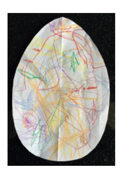
Imogen Kemp, aged 3