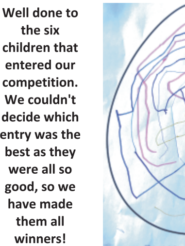
children that entered our competition. We couldn't decide which entry was the best as they were all so good, so we have made