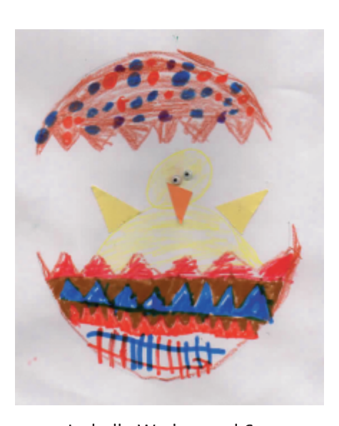
Isabelle Wade, aged 6