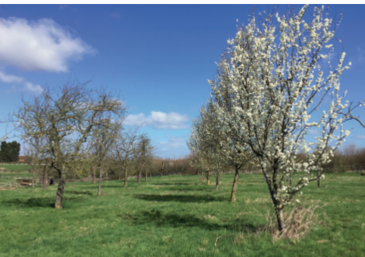
The orchard at Woolpecker Park in bloom