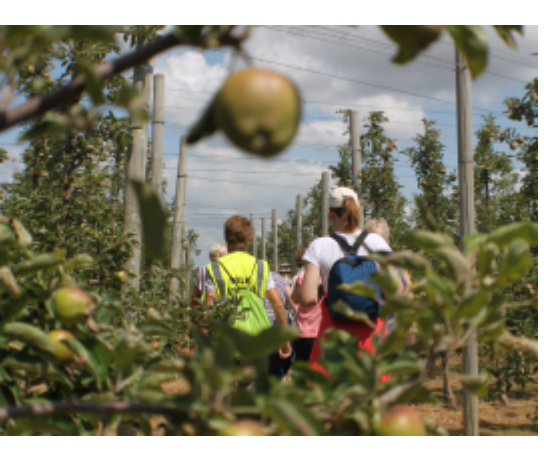
Photos of one of our recent walks through the fields surrounding Iwade.