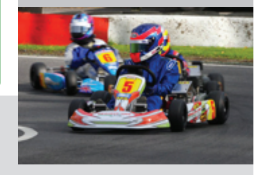
One and RPM for all their support during 2010.