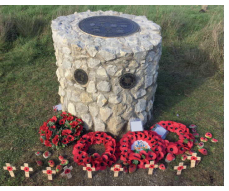
The Cairn on Remembrance Sunday