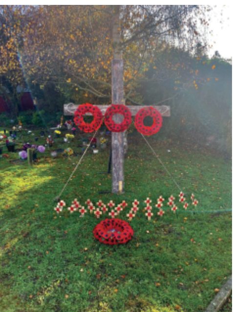
especially as they enabled me to glimpse something of what it really means to remember.

In attendance at the service were men who had served in the Armed Forces who were remembering the comrades they had fought alongside those who were injured, those who died - and the situations that they witnessed. It was a privilege to have shared Remembrance Sunday with them and