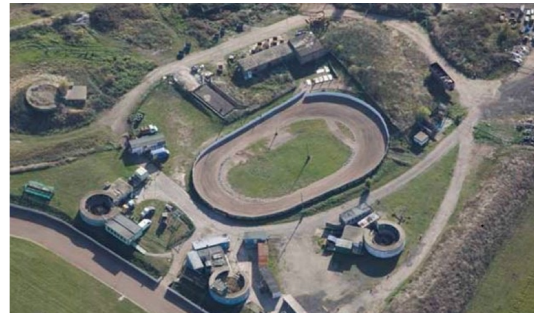
Aerial view of the old Anti-Aircraft site showing the round gun mountings.