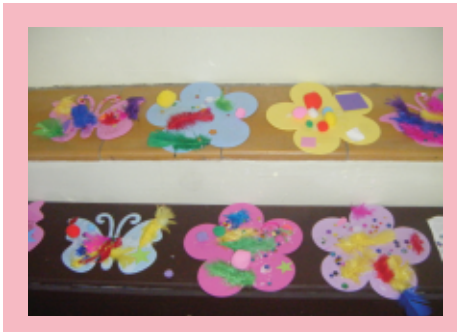
Craft made by the children at Iwade Parent and Toddler Group.

Join us on a trip of a lifetime and cycle for 5 days through rural Rajasthan along with other like minded people and raise funds for the Kent Multiple Sclerosis Therapy Centre in Canterbury (KM Charity of the Year 2010). This will be the 2nd major fundraising event for the Centre which provides therapies, advice and support for people with MS in Kent. We are looking for over 30 people to take part in the event which finishes with a visit to the Taj Mahal. For more info and a registration pack call 01303 862 996 or email info@lifecyclepromotions.co.uk or visit www.kentmstc.co.uk