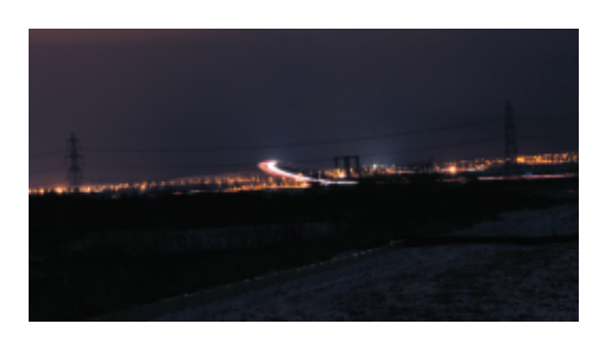
View of the Sheppey Crossing from Iwade, taken by Christina Craycraft who also took our front cover shot.