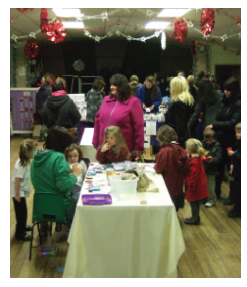
Tinkerbells busy and bustling Christmas Fayre in the village hall.