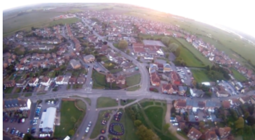
Left, an aerial view of our wonderful village from above Woodpecker Park.