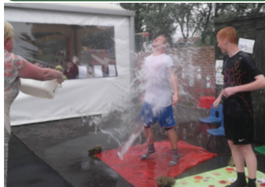
Looks like everyone enjoyed throwing wet sponges at Iwade School's P.E staff. What good sports!