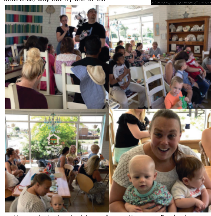
You can be kept up to date on all our antics on our Facebook page www.facebook.com/mewsbrewhouse We look forward to seeing you all very soon