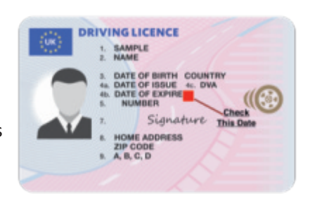
Photo-card licences replaced paper licences in 1998, and must be renewed every 10

The DVLA says a whopping 2.3 million photo-cards are out of date.