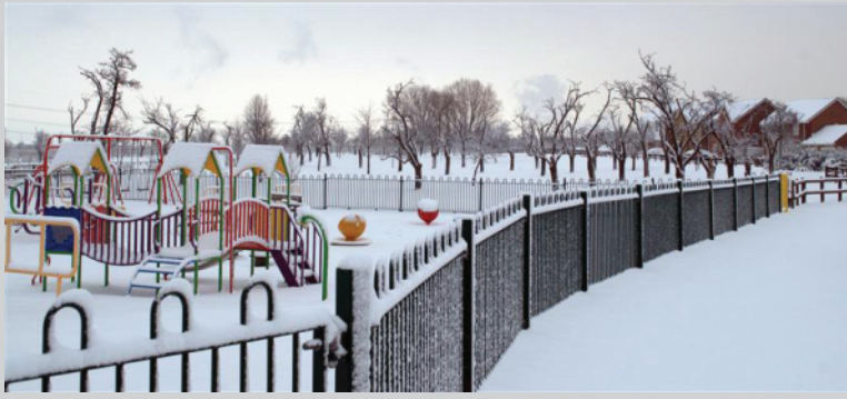
Above: Woodpecker play area by Simon Filmer Left: Photo by Gary Shovellor