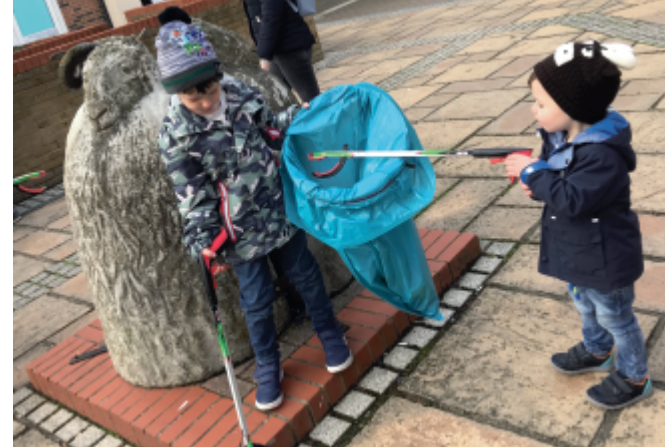
Local villagers making a difference at the Village Clean Up held on Saturday 23rd October.