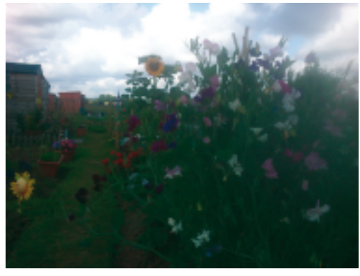
Beautiful and tasty - the sweetest member of the Pea family

With harvest season upon us, there seems no better time to reflect on the first full year at our own village allotment site. During 2012, a community garden has been completed, benches and picnic tables installed and a new notice board built. A number of social gatherings have taken place, including the official