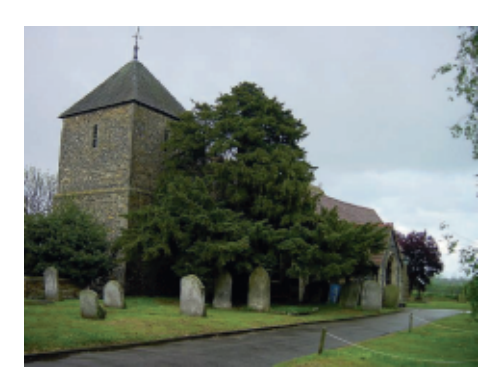
Don't forget the churches website!

purchase, in the parish of Borden, about three miles from Iwade, the annual rent of which was twenty eight pounds.