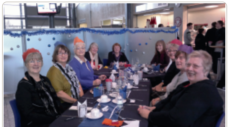
WI ladies at Mid Kent College for lunch and a show!