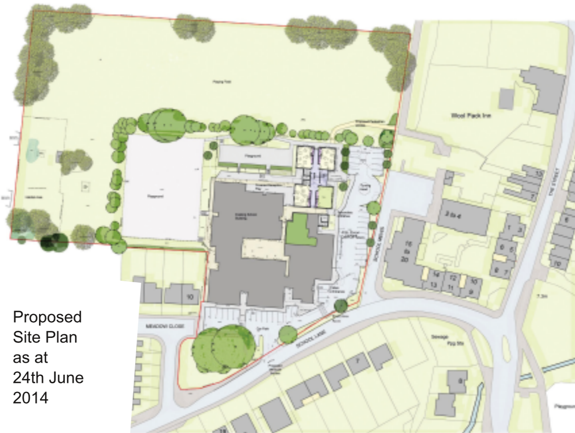
Proposed Site Plan as at 24th June 2014

2.1.8 Further details of the design of the proposed development can be found in the accompanying Design and Access Statement."