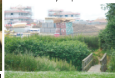
View from Mansfield Bridge