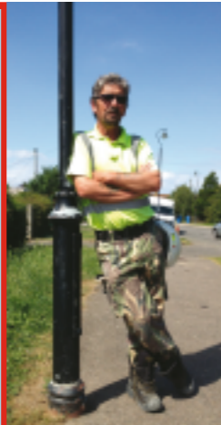
The man on the hill