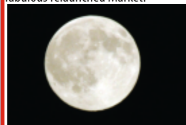
June's full moon over Iwade with thanks to Carl Waldie