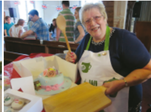
All Saints Church provided the venue for the Iwade Bake Off..... Mmmm...cake.... Thank you all! £596.98!