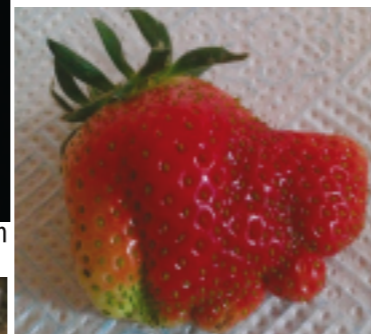
What summer would be complete without comically shaped fruit?