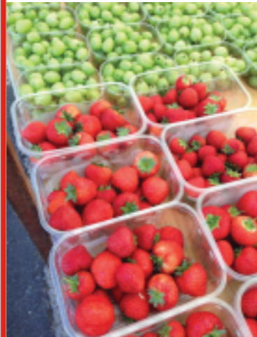
Delicious fruit available at Iwade's fabulous relaunched Market!