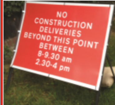
Keeping School Lane construction lorry free during the school run.