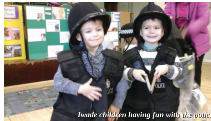
Iwade children having fun with the police

Following on from our topic last term on 'People who help us' and 'Keeping safe', we were very fortunate to have a visit from the local police. The children were given the opportunity to sit in and look at the equipment in the police car and took part in a talk led by the police officers on 'Stranger Danger' and how to keep safe and what to do in an emergency. The children found this an enjoyable experience and we would like to take this opportunity to thank the Policemen very much for taking time out to come and see us.