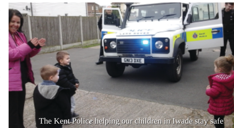
The Kent Police helping our children in Iwade stay safe

We are currently full at both Iwade and the Clock tower settings, and nearly full to capacity on our waiting list for September, however there are a few sessions still available. Therefore if you are interested in a place for your child from September 2016, please get in contact with us as soon as possible to avoid disappointment.