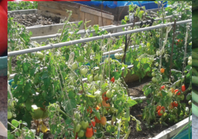
The Iwade allotments

If you feel that you would like to join us on the allotment gardens and enjoy growing your own fresh produce, give me a ring on 01795 473116 with your details. It is cheaper than going to the gym!