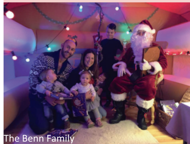
The Benn Family

Two weeks later is the Indoor Boot Fair on Sunday 26th February between 10-2. Stalls are just £5 each, so if you need a good clear out after Christmas, please get in touch with Sho on 07724 862744. It's the ideal event as all you need to do is book your stall, then turn up on the morning with your treasures! No standing in a field getting cold or sunburnt, nobody rummaging through your boot for mobile phones and we have clean toilets! Tables and chairs are provided so you don't even need to dig out that old pasting table from the shed! Call Sho today for more details and to book your table.