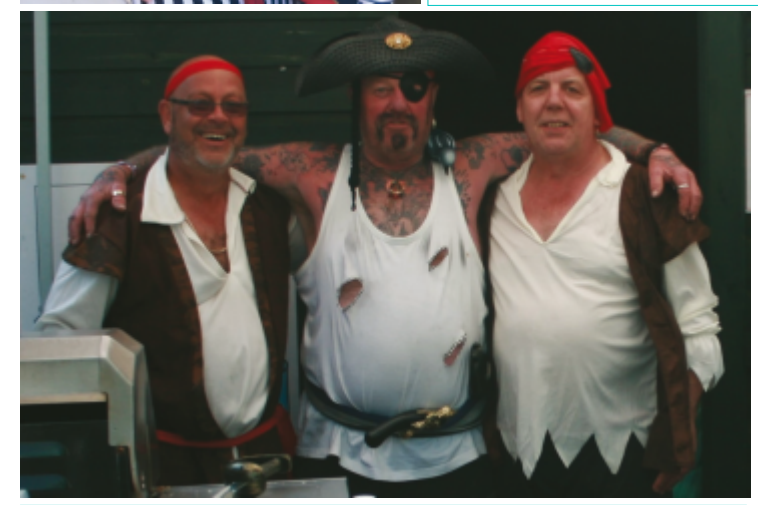
The 3 BBQ pirates worked tirelessly to provide a lovely BBQ and when all the fun of outdoors got too much, there were lots of activities inside to keep the children occupied. Not to mention the delicious cakes made by our cook and also donated by our parents.