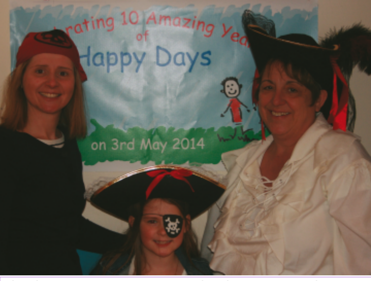
Thank you again to everyone that has supported us over the last 10 years and for all our staff that helped make Happy Days an "outstanding nursery".