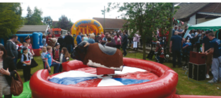
The children and the parents had great fun on the Rodeo Bull!