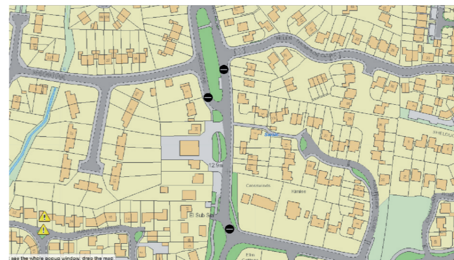
Christmas Lighting Event Road Closure Map

● = location of Barriers, the road will be closed between these points for the safety of the public.