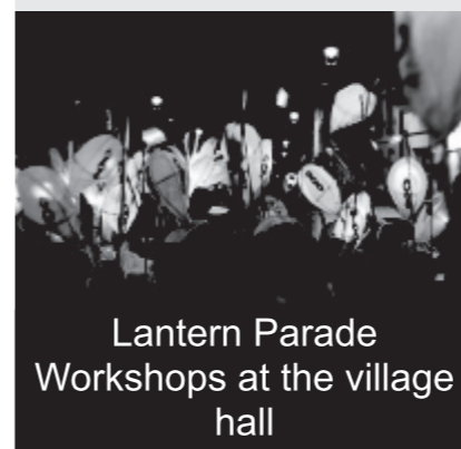
Lantern Parade Workshops at the village hall

www.iwadevillagehall.co.uk or by contacting bookings@iwadevillagehall.co.uk and please also keep up to date on the Hall's Facebook page.