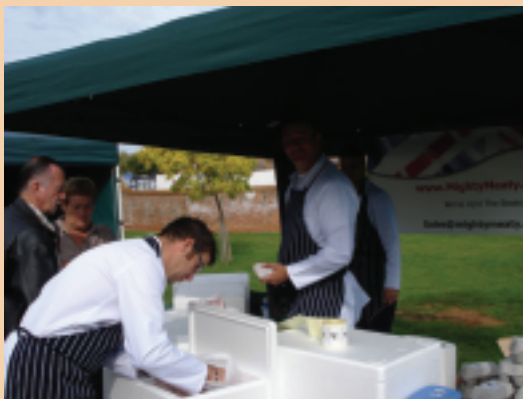
Mighty Meaty at Iwade Farmers Market

indeed guilty but beyond our reach. Tolerance must be extended, even if we feel ourselves to be victims of intolerance. But if we consider ourselves to be Christian, there are deeper obligations to Christ: compassion for all, welcoming the stranger, toleration of differences, love and forgiveness for all. We must defend ourselves but should never fall victim to the tragedy of bitterness and hatred. The love of Christ compels us.