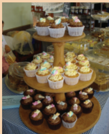
Cornucopia Homemade preserves & cakes at Iwade Farmers Market