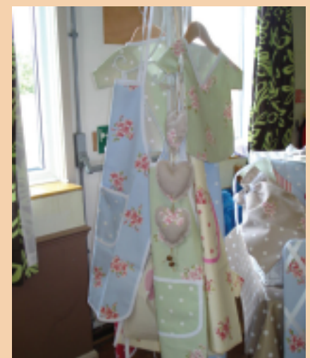
Sew Home at Iwade Farmers Market