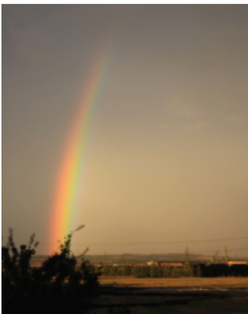
A rainbow over Iwade